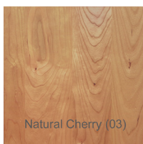
Natural Cherry (03)