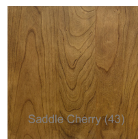
Saddle Cherry (43)