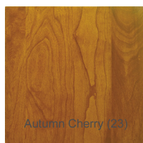
Autumn Cherry (23)